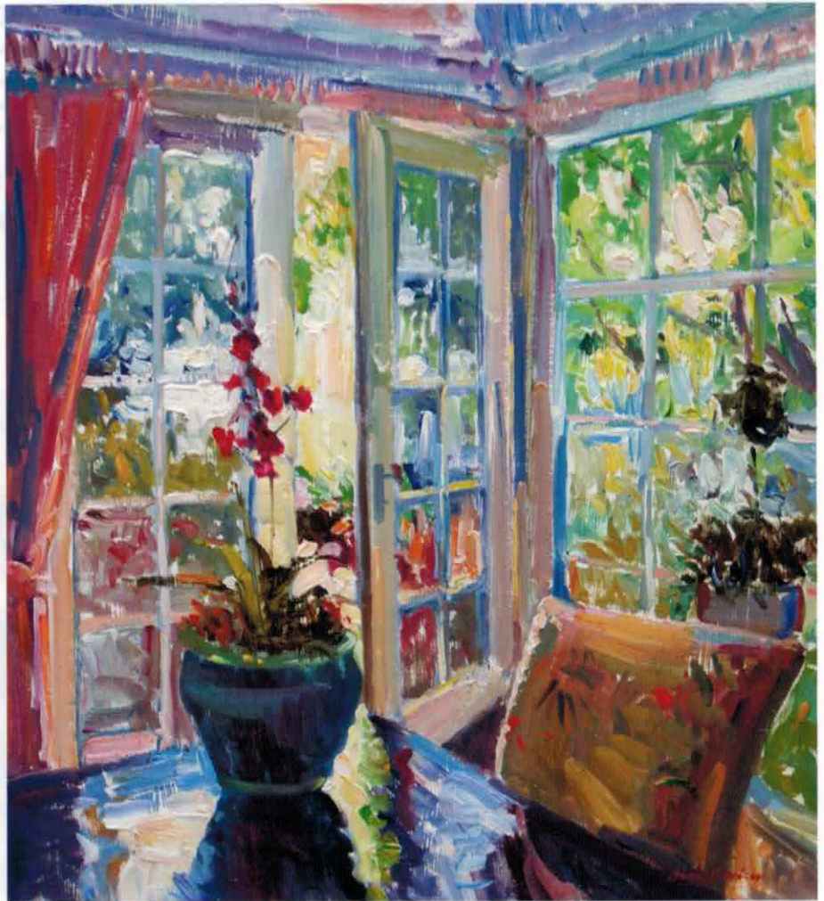
"Breeze," oil, 22" x 20"

Daniel Bayless' paintings are shown at Alexandra Stevens Gallery of Fine Art, 820 Canyon Road, across from the public parking lot. Open daily. (505) 988-1311. www.alexandrastevens.com .