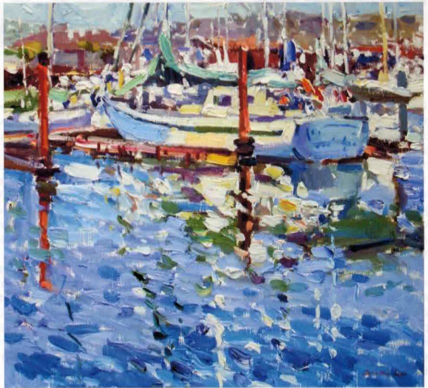
"Summer Light," oil, 22" x 24"