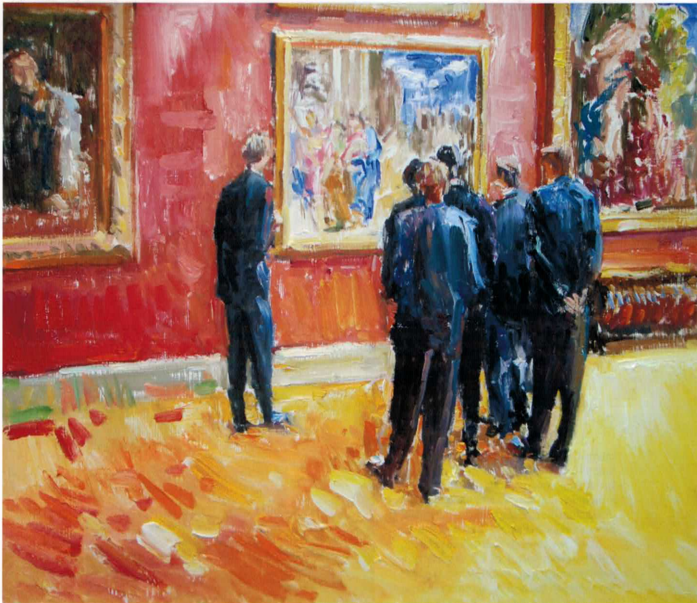
"Searching for Saints," oil, 26" × 30"